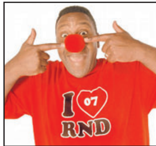
Mr Red Nose himself alias Lenny Henry

From the money raised over 10 Red Nose Days, Comic Relief has spent more than £10.2m on nearly 500 projects in the north west.