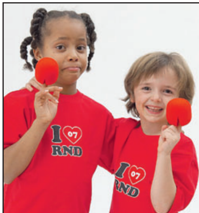
Don't forget to wear your red nose and tee-shirt on the day

COMIC RELIEF is back for 2007 and The Big One promises to be nothing short of enormous! Preparations are well under way for the imminent arrival of Red Nose Day this Friday, March 16 and it is not too late to get involved and make a big difference.