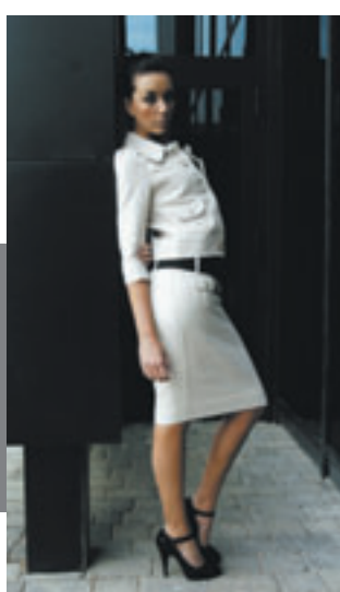
Black blouse, £28, Miss Selfridge; Suit jacket, £75, S'nob @ Drome Boutique; Skirt, £45, S'nob @ Drome Boutique; Black shoes, £80, Faith

The easiest way to look chic and keep cool during the summer is to embrace those neutral shades. Black is at the heart of every wardrobe and there's no reason why it shouldn't play a part in making a stylish you. Black linen trousers or a cotton skirt combined with a black vest top or shirt looks smart and sassy. Choose tan shoes and accessories for a more summery feel.