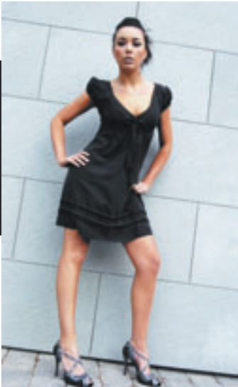
Black and charcoal dress, £45, Miss Selfridge; Black and silver shoes, £245, Kurt Geiger