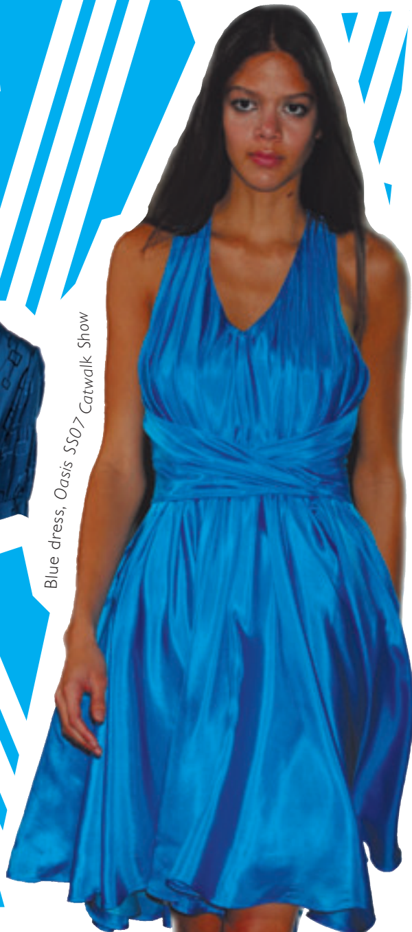
Blue dress, Oasis SS07 Catwalk Show