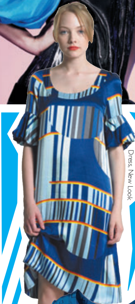
Dress, New Look