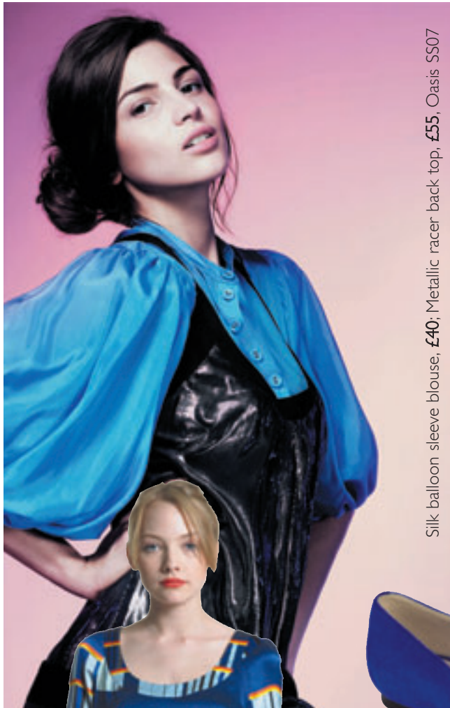
Silk balloon sleeve blouse, £40; Metallic racer back top, £55, Oasis SS07

For general enquiries call Head Office on 01509 620222 or visit www.rosemary-conley.co.uk