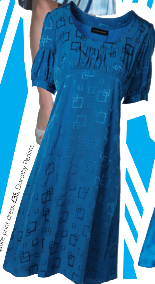
Cobalt square print dress, £35, Dorothy Perkins