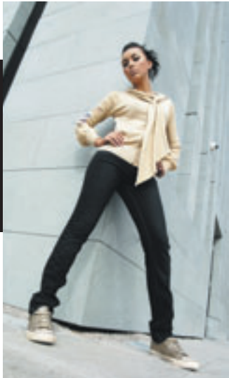
Gold glitter zip sweatshirt, £95, Laura Lees @ Drome Boutique, Bold Street, Liverpool; Black jeans, £40, Topshop; Gold trainers, £75, Ash @ Drome Boutique