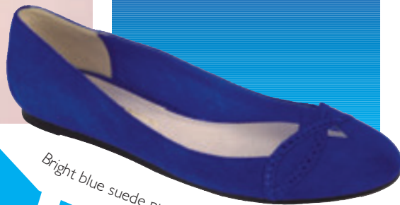
Bright blue suede pump, £65, French Connection

Stunning, vibrant and bold; dressing in blue is not for the shrinking violet. Worn with anything but an air of confidence and the essence of the shade is lost. From the summer shades of aqua and turquoise to the rich royal blue the catwalk shows were flooded with dresses, coats and shoes in every hue. Blue may not be your typical show stopper but accessorised with a golden tan it's the epitome of chic glamour. Steer clear of top-to-toe blue, unless it's an amazing dress, and instead try sheer shirts or loose-fitting jersey tops or smocks. An electric blue maxi-bag, slither of a belt or flash of pumps will add a bit of true blue confidence to any wardrobe.