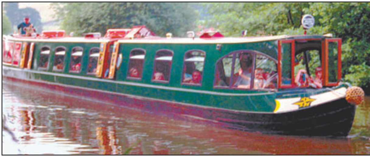
Take life easy on a canal boat

So whether you join them on a public trip or your own private charter from Macclesfield, you are guaranteed the warmest of welcomes on board Milford Star.