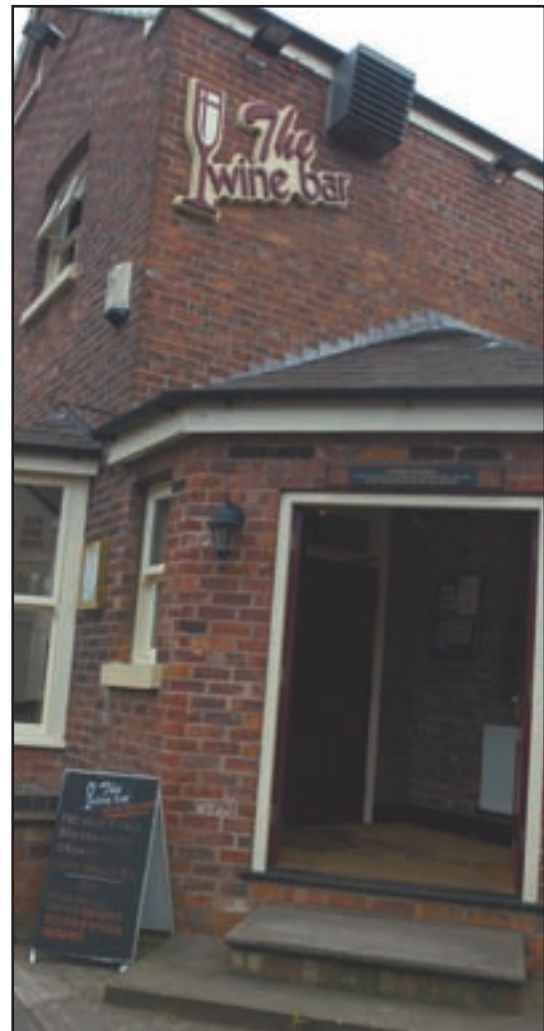
Contemporary ambience at The Wine Bar

Pirates Paradise can be found at Unit 8, Manor Lane, Holmes Chapel and is open weekdays from 9.30am to 6.30pm and from 9.30am to 5.30pm weekends and bank holidays. The entrance fee is just £3.50 per child and for more information, visit the website www.boredtotears.co.uk or call 01477 549008.