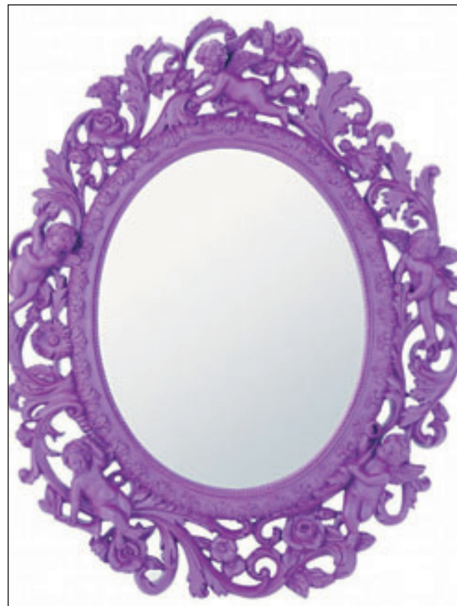
Ornate purple Cherubino mirror from Paperchase, £25

Paint one wall a darker colour than the rest of the room. Hang a mirror on the dark wall and a picture on the opposite, paler wall. This will have the effect of giving the dark wall more depth as it appears to recede to contain the picture.