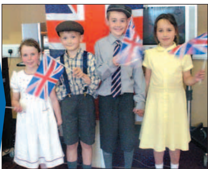
ABOVE: PUPILS in Year 3 and 4 at Rainford C of E Primary School held a party to celebrate VE Day.

Kids get a taste for Spam as they whirl back to the war years