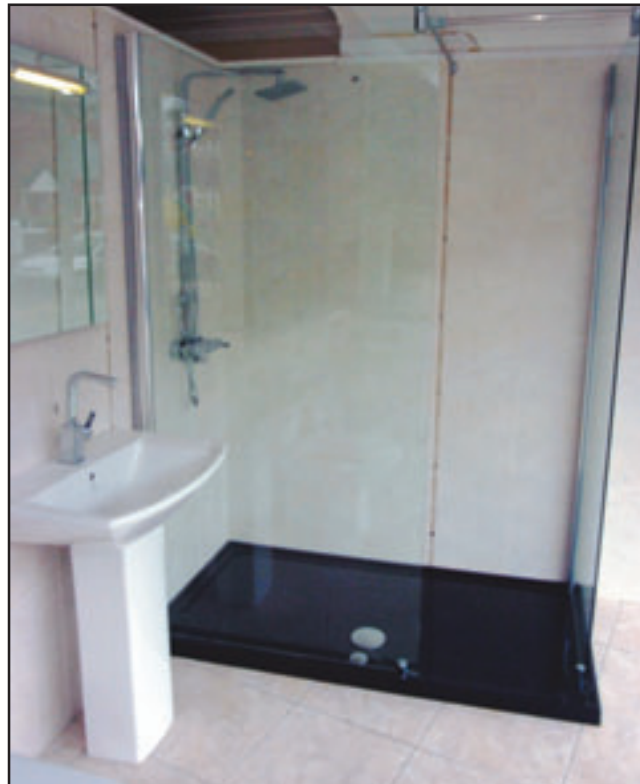
Stylish products are available at Urmston Bathrooms.