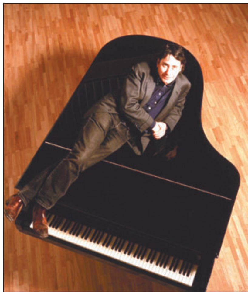
Jools Holland presents his 14th Hootenanny on New Year's Eve

So there you have it, enjoy this heady mix!