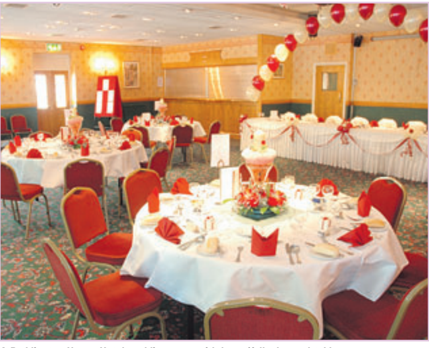
A Paddington House Hotel wedding room with beautifully dressed tables

The Woolston Suite is an intimate wood panelled suite is suited for the small civil wedding and can accommodate up to six guests. This suite makes a delightful alternative to traditional function room facilities.