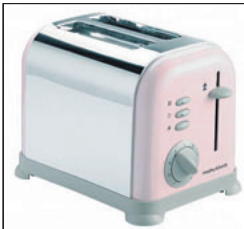
Morphy Richards Pink Cancer Awareness Toaster from Debenhams