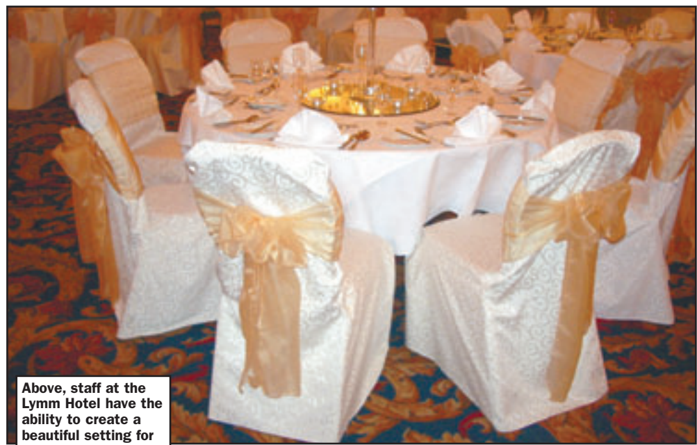
Above, staff at the Lymm Hotel have the ability to create a beautiful setting for your wedding