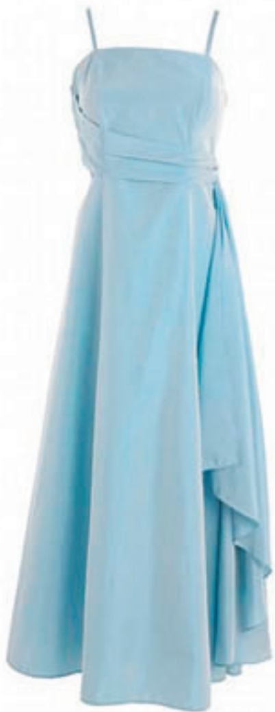
Aqua taffeta adult bridesmaid dress available from Debenhams

Once registered with Debenhams Wedding Service, they will also receive a pack of special offers and promotions to help them save money on fashions, accessories and cosmetics.