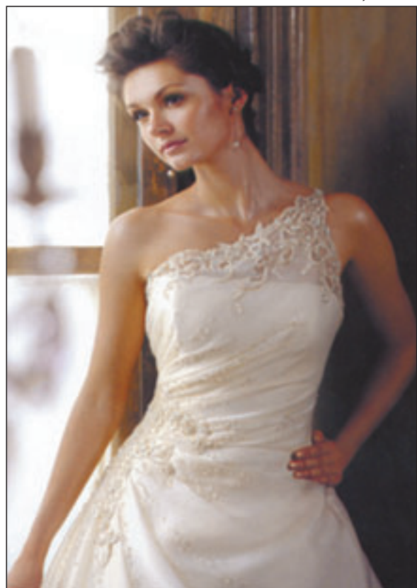
Wedding gown by Cheshire Brides of Frodsham

So for more information, come along to the Wedding Fair this Sunday and see what The Holiday Inn has to offer you and your partner.