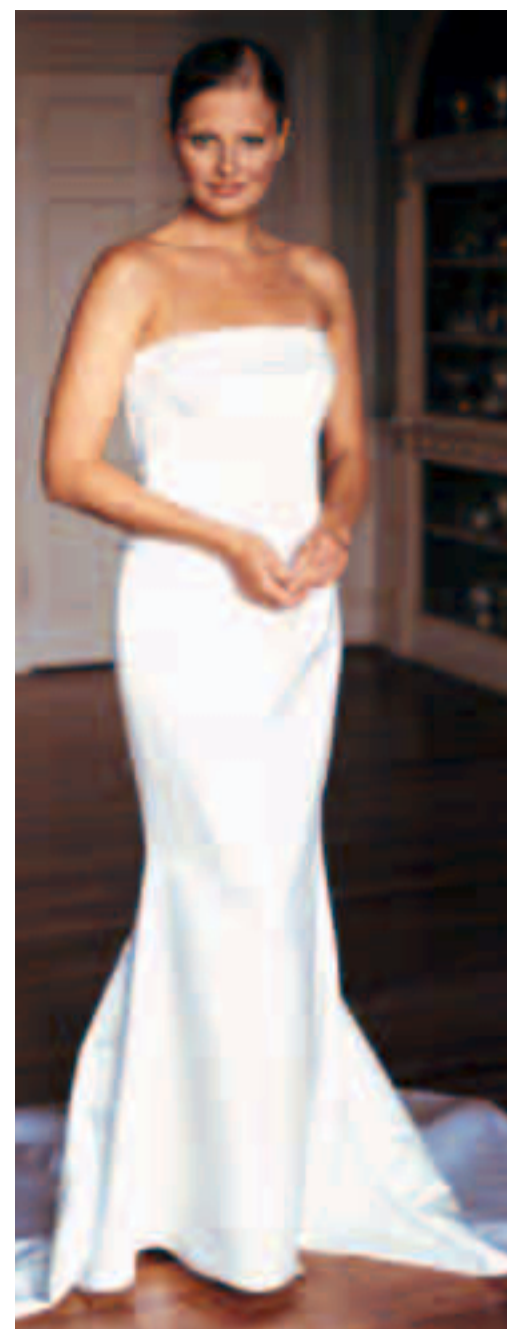
Figure shape and height should be taken into account