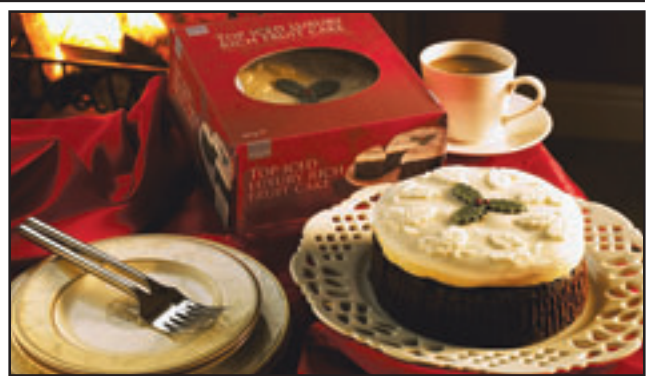
FESTIVE FAYRE: Get set for Christmas

The weekend break is valid from November 27 to December 24 2006. Usual Globe rules apply. Good luck!